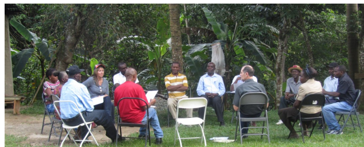
The Pastoral Council of St. Rock parish with our Mission Team.